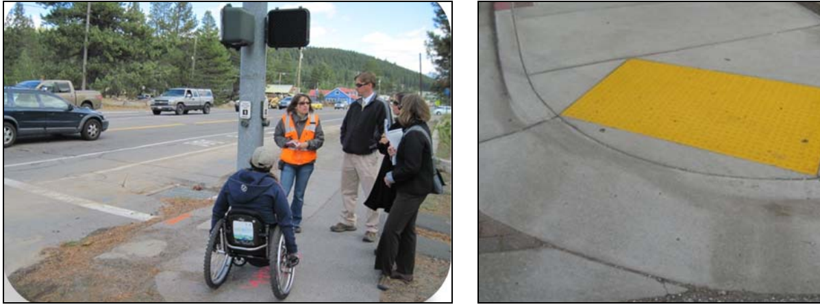
Walking audit in Truckee allows a closer look at issues

"walking audits" in key areas of the jurisdictions with NCTC staff, jurisdiction staff, and interested citizens. The purpose of the walking audits was to candidly assess how well the existing pedestrian infrastructure safely accommodates all users, including the ease of use and accessibility of facilities by the disabled. The plan documents where curb ramps with "truncated domes" (pictured below right) are needed to alert pedestrians with vision impairments of their approach to streets and hazardous drop-offs.