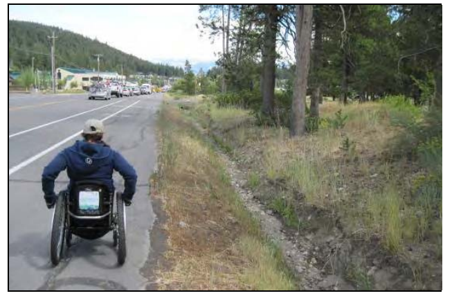
Sidewalks are needed on key segments of Donner Pass Road

One of the biggest obstacles and potential safety issues posed to walking in Nevada County is the lack of continuous sidewalks outside of downtown Grass Valley, Nevada City, and Truckee. The plan identified and mapped recent vehicle-pedestrian collisions, which exacted the quantity and nature of these types of accidents. Pedestrian-vehicle collision "hot spots" were analyzed to propose development of future safety projects. This analysis revealed that the most common collision type in Nevada County involves pedestrians forced to travel in the streets due to a lack of safe routes (see photo below).